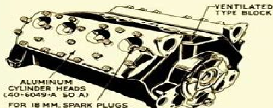
48-6012—(FOR 1935-36 PASSENGER AND COMMERCIAL CARS)