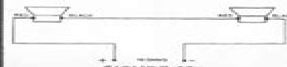
FIGURE 12 Connection of 2 EVM-15L Speakers in Series