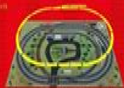
A Hornby® Western Master is shown here in the RailMaster software.