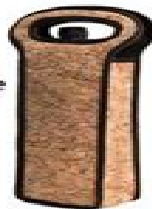
cork wine sleeve