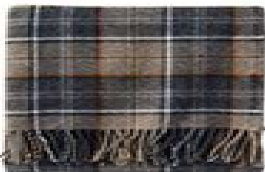
cruelty-free wool blanket