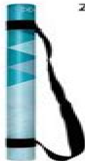
recycled natural fiber yoga mat