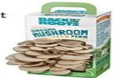
home mushroom growing kit