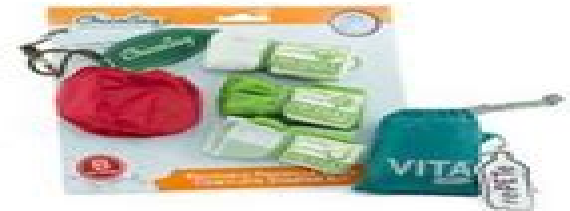
zero waste grocery kit