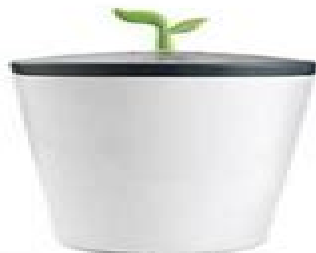
countertop compost bin