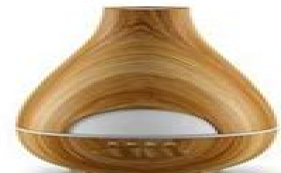
essential oil diffuser