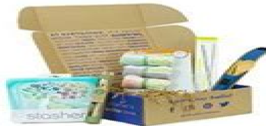
zero waste home starter kit