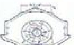
GM TH-400, 350, 250-48, 700R4, 3.80, 4.10, 4.60 Chevrolet