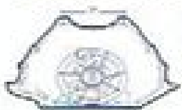
GM TH-400, 350, 250-48 Buick, Olds, Pontiac, V8, V6