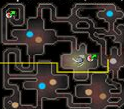
Sepulchre of Death (4th Level)

Open for: - Unlock "Idea" emote - Receive 5,000 coins