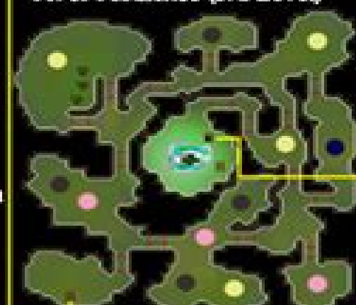
Pit of Pestilence (3rd Level)

Rope Takes you back to the starting point of the Level