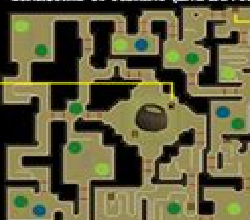
Catacomb of Famine (2nd Level)

Open for: - Unlock "Flag" emote - Receive 2,000 coins