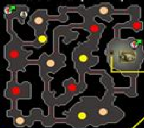
Vault of War (1st Level)