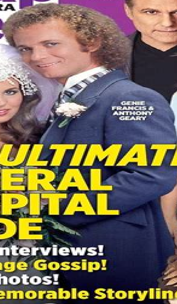
GENIE FRANCIS & ANTHONY GEARY