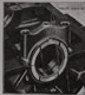
FIG. 7. TIGHTENING TIGHT BOND