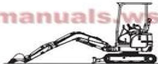
Bucket position at the time of checking the hydraulic oil level.

Hydraulic oil should be changed in every 500 service hours.