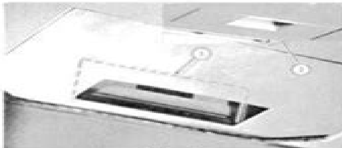
Figure 5 Air Vent

Figure 6 (This shows a standard AM, AM-FM Stereo and AM-FM Stereo Tape Deck).