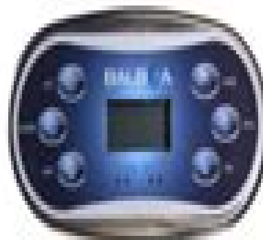
Balboa VL200 / VL400