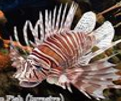
Lion Fish (Invasive)