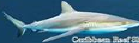
Caribbean Reef Shark