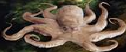
Caribbean Reef Octopus