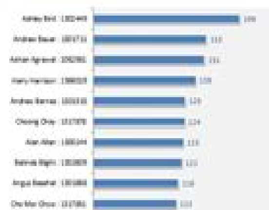
Annual Leave Days