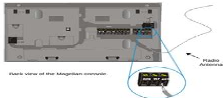
Back view of the Magellan console.