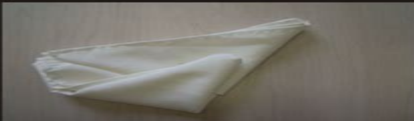
STEP 6: Fold the triangle in half