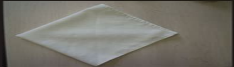
STEP 4: Flip the napkin over while keeping the corners folded up