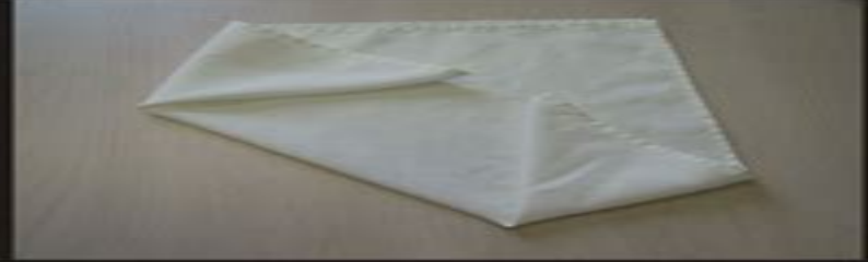
STEP 3: Bring bottom corners up to the top of the triangle you have created