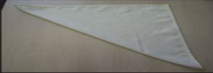
STEP 2: Fold napkin in half