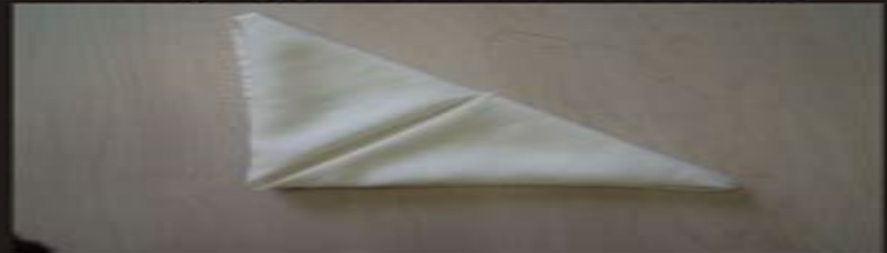
Step 5 complete