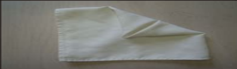
STEP 5: Bring the bottom point up to the top point