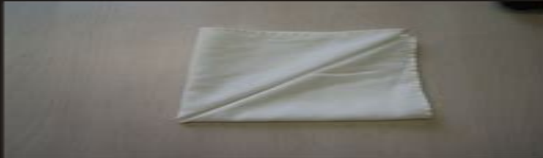
STEP 3 complete