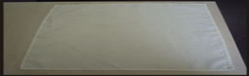
STEP 1: Lay napkin flat on a surface