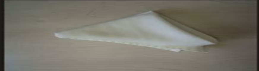
STEP 6 Complete. Now stand the napkin up