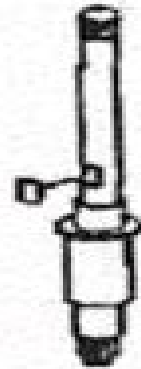
Description Part # 1 Drive Shaft Bearing Chart pg 38 2 Pinion Bearing Chart pg 38 3 Pinion Nut 18-3719 4 Inside Bearing Chart pg 38 5 Outside Bearing Chart pg 38 6 Carrier Bearing 18-1158 7 Reverse Gear Bearing 18-1155