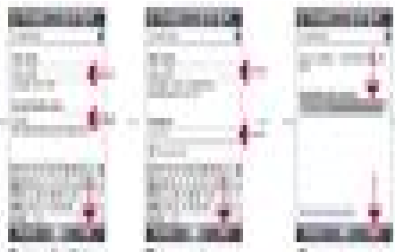
4. Enter account information in the New E-mail Account dialog box.