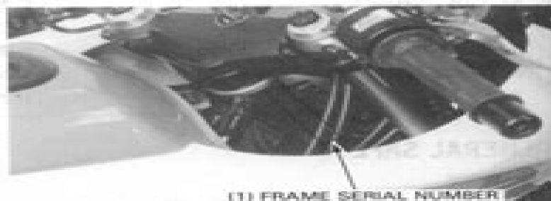
(1) FRAME SERIAL NUMBER

The frame serial number is stamped on the right side of the steering head.