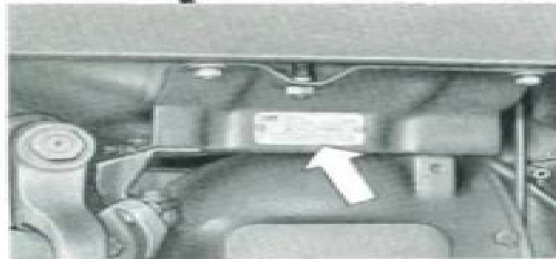
Fig. 3. - Identification Data Plate.