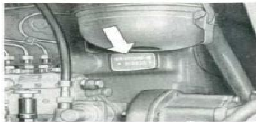
Fig. 1. - Engine Serial Number.