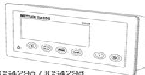
ICS429a / ICS429d