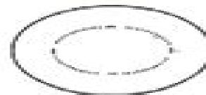
Before one hour

Item 4 refers to the following diagrams which show a red blood cell before and after being placed in a concentrated salt solution for one hour.