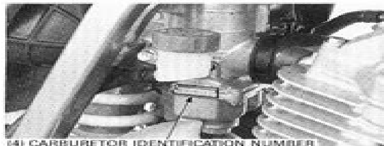
(4) CARBURETOR IDENTIFICATION NUMBER

The frame serial number is stamped on the right side of the steering head.