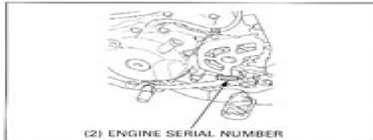
(2) ENGINE SERIAL NUMBER

The Vehicle Identification Number (VIN) is located on the front side of the steering head.