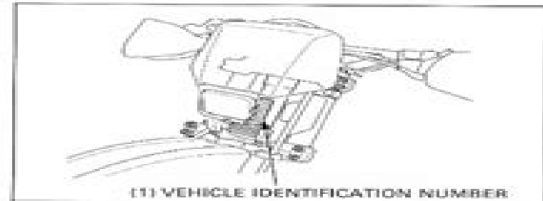
(1) VEHICLE IDENTIFICATION NUMBER

The Vehicle Identification Number (VIN) is located on the front side of the steering head.