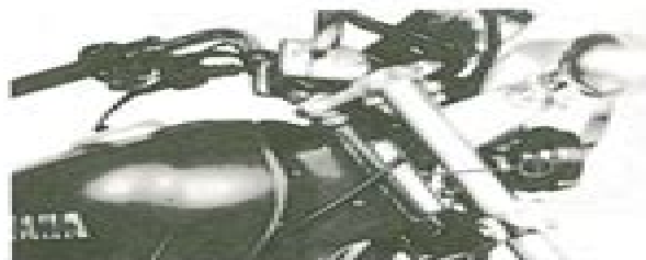
1. Vehicle identification number

The vehicle identification number is on the right side of the steering head pipe.