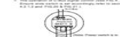
FIG. 3-2 Argus Dual Track Surface Mount version (FIG. 3-2)