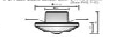
FIG. 1-3 Argus Dual Track Surface Mount version (FIG. 1-3)