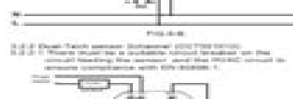
FIG. 3-8 Argus Dual Track Surface Mount version (FIG. 3-8)