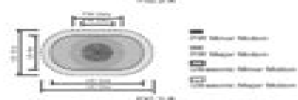
FIG. 2-2 Argus Dual Track Surface Mount version (FIG. 2-2)