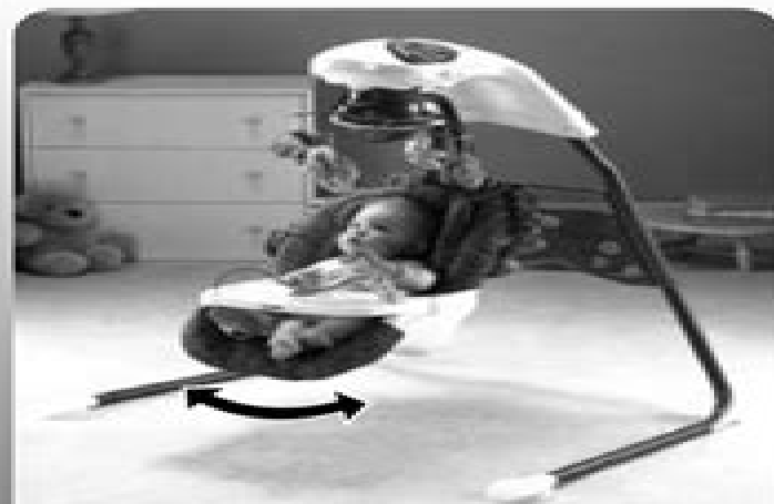
Cradle (Seat moves side to side)