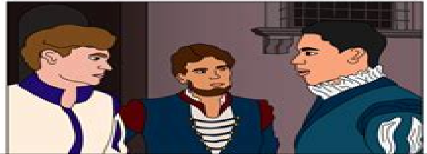
Don John sabotages Claudio and Hero's wedding