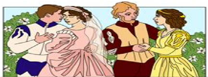
Both couples get married