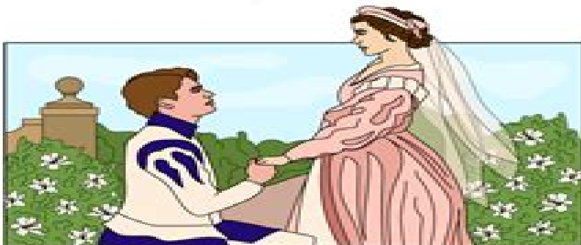
Hero's innocence is declared and Claudio and Hero are reunited