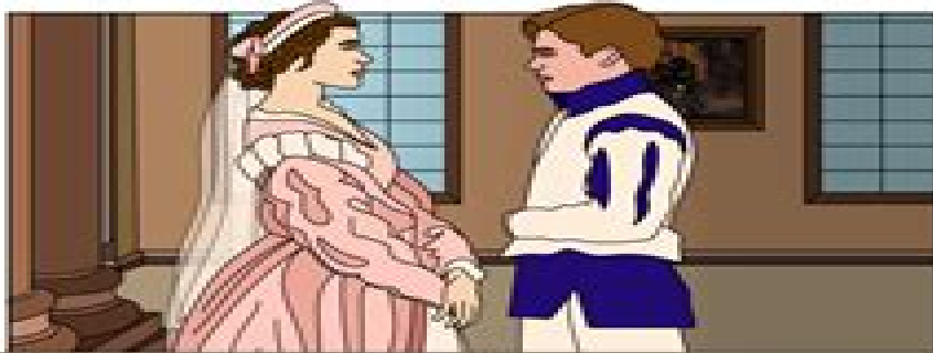
Claudio falls in love with Hero and Don Pedro arranges their marriage