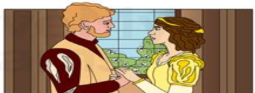
Beatrice and Benedick finally declare their love for each other