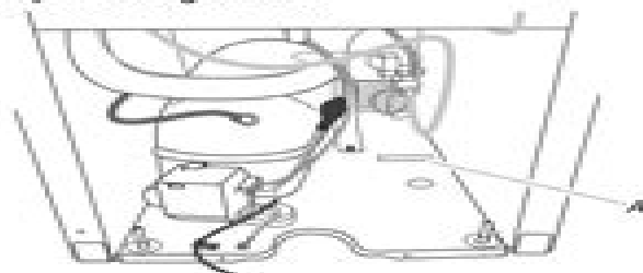
A. Mounting tab slot