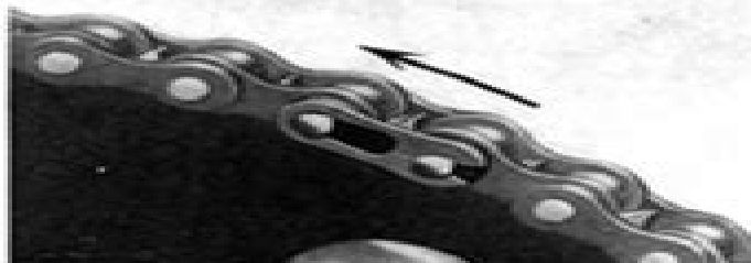
20 H Lage der Kettenschloßsicherungsfeder