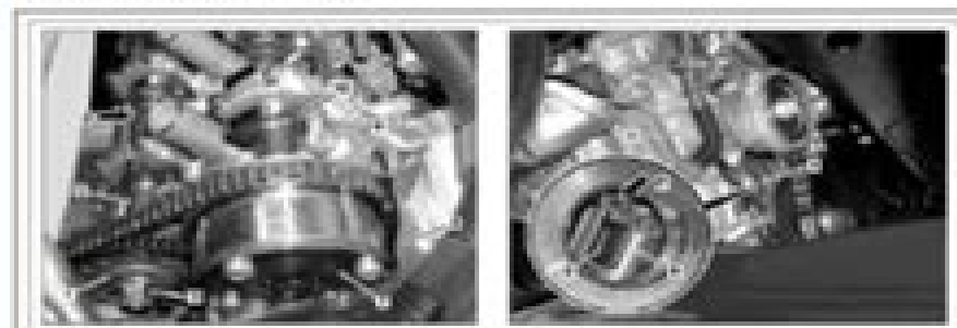
Fig. 2. Identifying Correlated Components