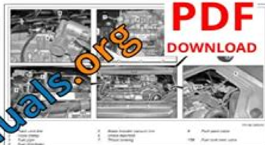
Fig. 4. Handling Rear-Wheel Drive Module Components (1 of 2)