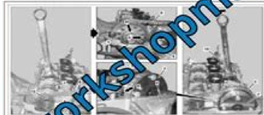
Fig. 3. Adjusting Campaign