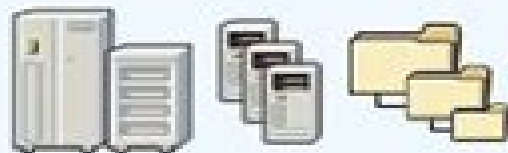
Databases, servers and directories