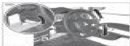
A- Locknut B- Wrench