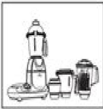
TWISTER (4 Jar)