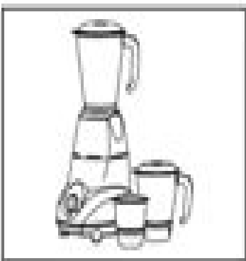
REX (2 Jar) REX (3 Jar)