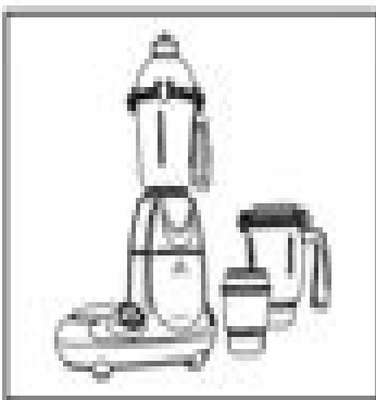
TWISTER (3 Jar)