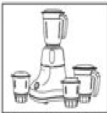
GX 400 DUO CHUTNEY JAR