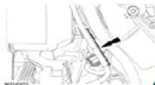
Fig. 10: Locating Electrical Connector Pin-Type Retainer Courtesy of FORD MOTOR CO.

Detach the electrical connector pin-type retainer.