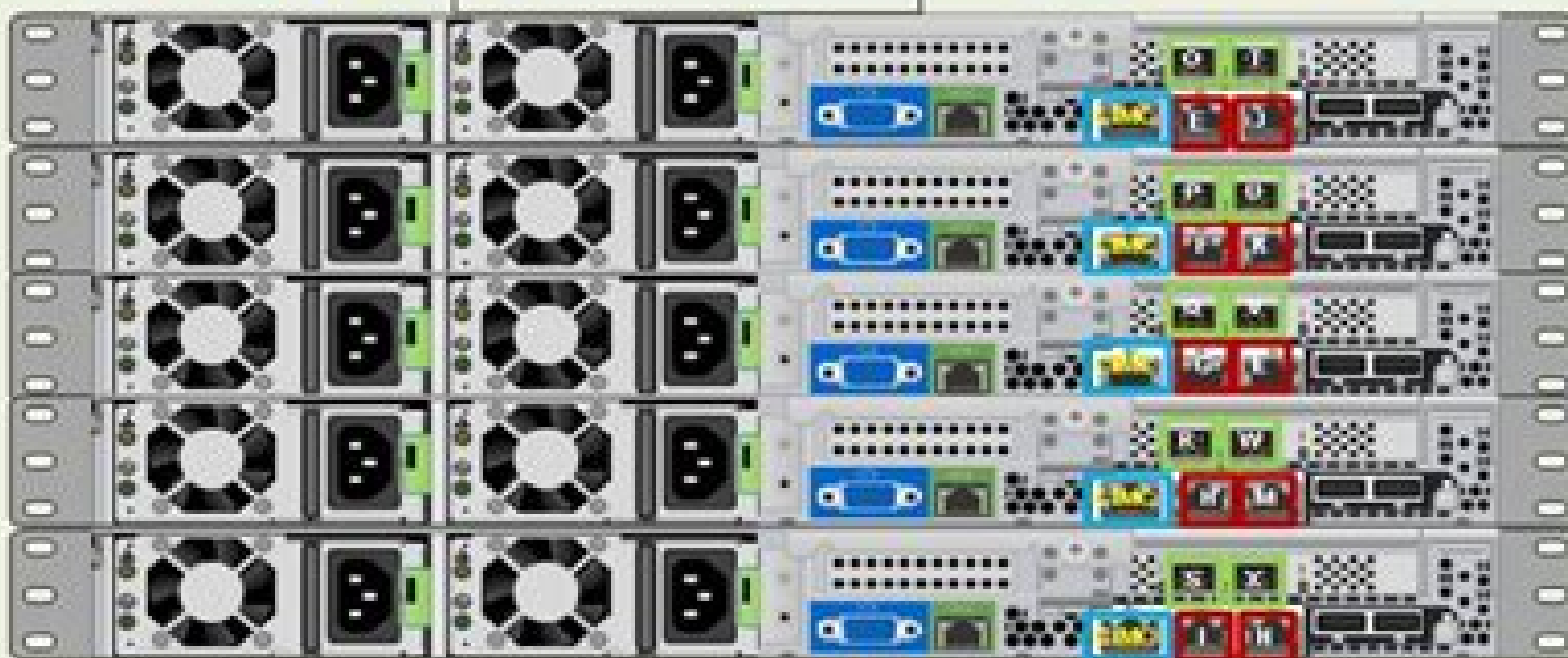
Cisco UCS C220 M3 Server 1