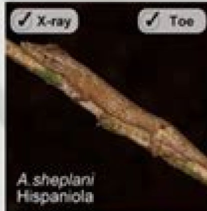
A. sheplani Hispaniola