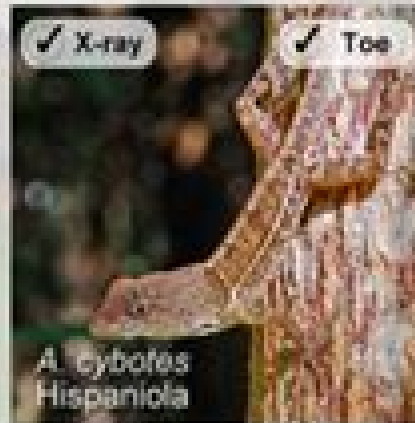
A. cybotes Hispaniola