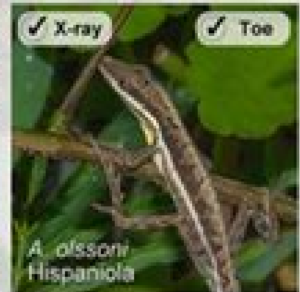
A. olssoni Hispaniola

Press each lizard photo above to measure. You can review how to take measurements by pressing on the "Tutorials" tab.