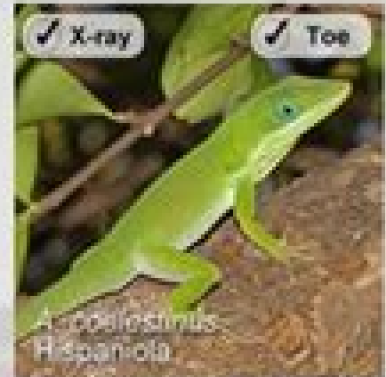
A. coelestinus Hispaniola