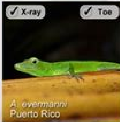
A. evermanni Puerto Rico