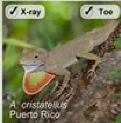
A. cristatellus Puerto Rico