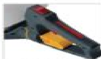
5-Position twist handle with safety lock-out and on/off switch