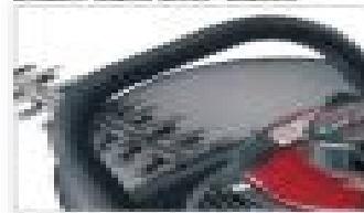
Transparent safety guard