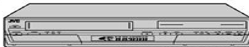
DR-MV1SUC, DR-MV1SUS [D3RV21]