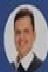
Shri. Devendra Fodharia Hon'ble Chief Minister

Global Project Fest 2023 हे 14.2023 ते 15.2023 मधील Jio World Convention Centre, Mumbai येथे आयोजित करण्यात आले होते. यात भाग घेतलेले ज्येष्ठ शिक्षक, स्टाफ यांचा यावेळी सन्मानित करण्यात आला. यावेळी यांनी आपले आपापले प्रोजेक्ट्स सादर केले.