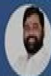
Shri. Anurag Shinde Hon'ble Deputy Chief Minister