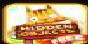
Hidden Object - Puss in Boots