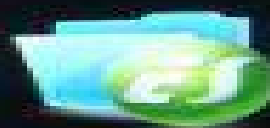
ES File Explorer