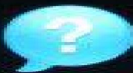
Help & Feedback