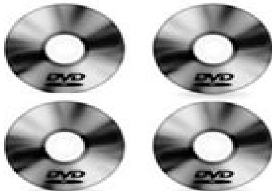
4 X DVD Set