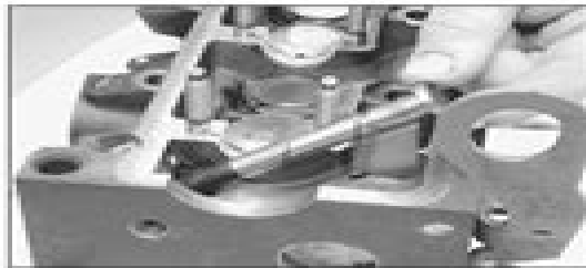
9.26 Refit the brake vacuum pump pushrod before refitting the camshaft

26 Lubricate the camshaft and cylinder head bearing journals with clean engine oil. If the