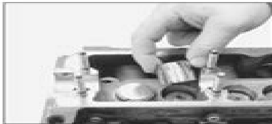
9.25 Lubricate the tappets before refitting

23 Inspect the tappets and shims for obvious signs of wear or damage, and renew if necessary.