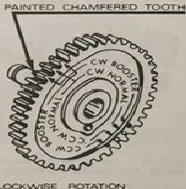
Figure 2-32. Modified Six Cylinder Gears