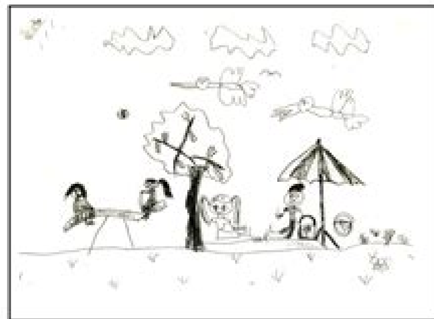
Figure 4: KFD