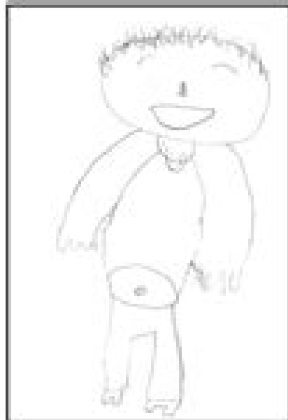
Figure 1: SHFD