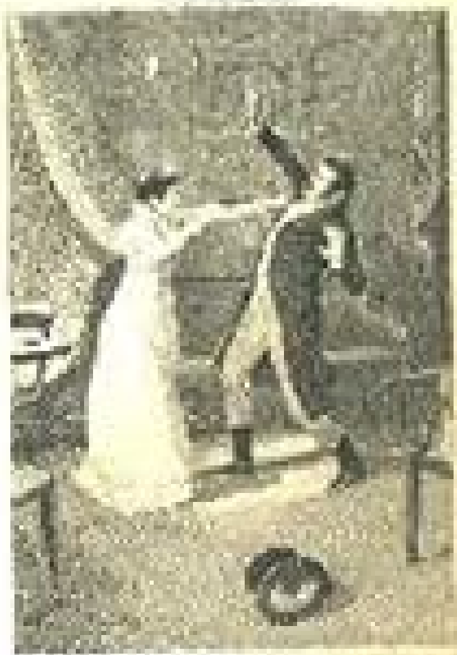
Portrait of a woman in a white dress at the entrance of the house