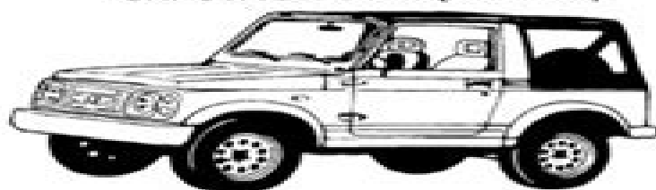
CAPOTA DE LONA (CANVAS)

Este manual do proprietário aplica-se aos seguintes modelos: