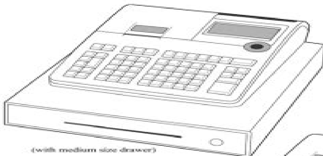
(with medium size drawer)