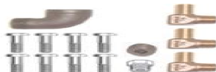
INT 1 6268P