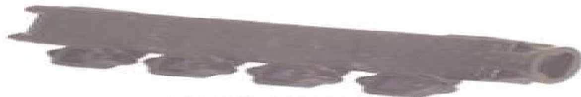
INT 1 6268R