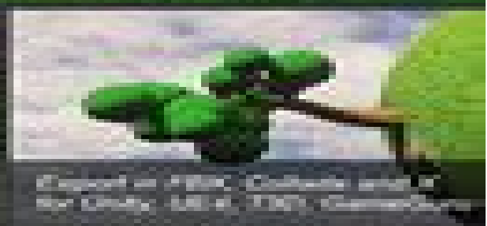
Coastal forest, coastal and other species