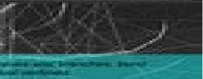
Abundant persistence of massive variety of plants and trees substantially including coastal land plants