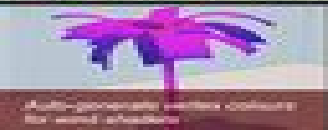
Abundant persistence of massive variety of plants and trees substantially including coastal land plants