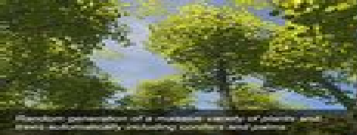
Abundant persistence of a massive variety of plants and trees substantially including coastal land plants