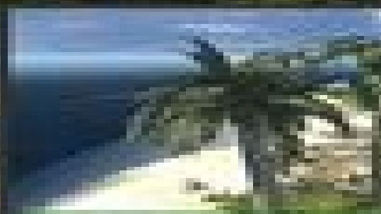
Coastal forests comprising the major part of plant from southern species in coastal and other parks