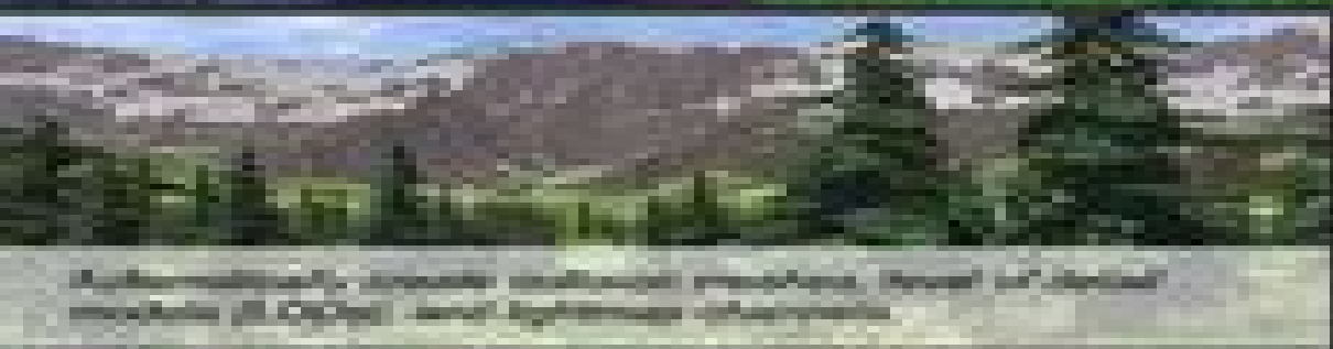
Substantially massive southern species, part of coastal forests (B. Bayonet) and southern species