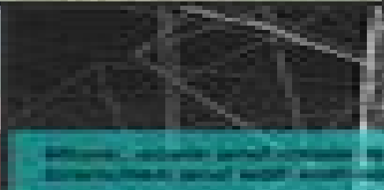
Abundant persistence of massive variety of plants and trees substantially including coastal land plants