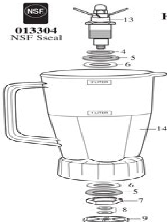
503120 - Blending Assy. Kit 502370 - Blending Assy. (older units)